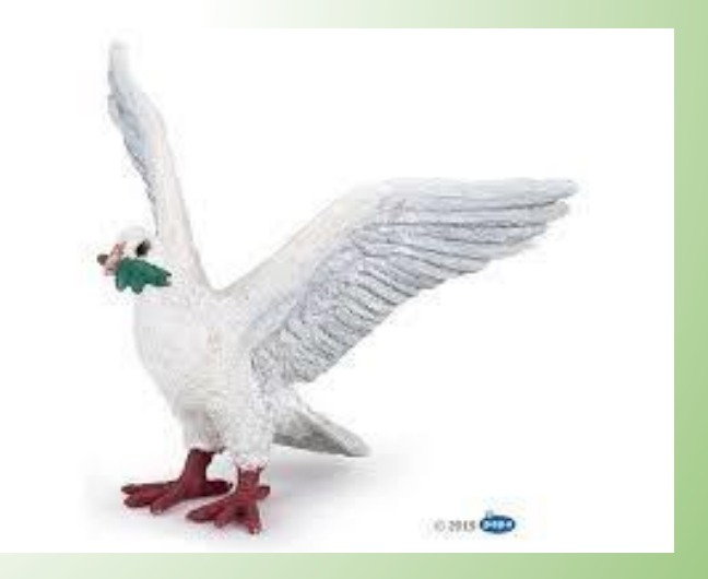
Prince of Peace