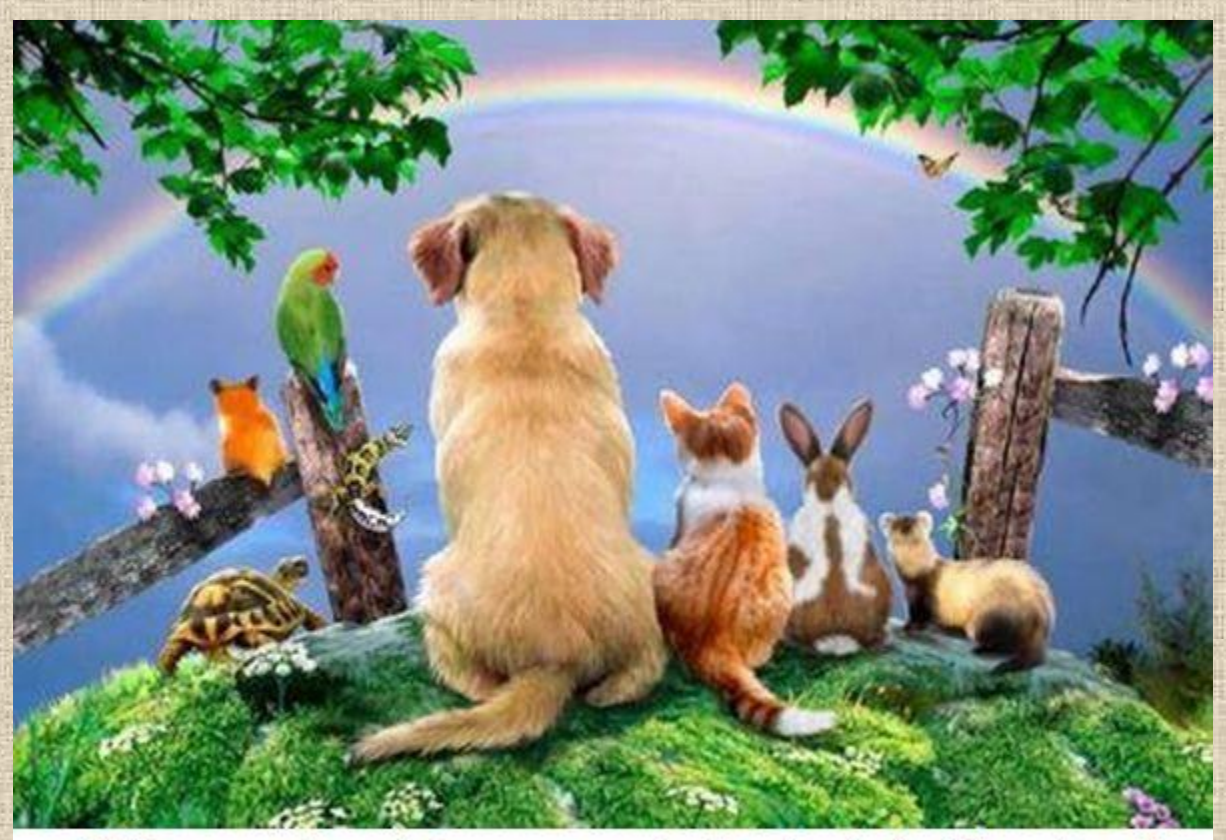
"Whenever the rainbow appears in the clouds, I will see it and remember the everlasting covenant between God and all living creatures of every kind on the earth." Genesis 9:16

Then God said, "Let us make mankind in our image, in our likeness, so that they may rule over the fish in the sea and the birds in the sky, over the livestock and all the wild animals, and over all the creatures that move along the ground." Genesis 1:26