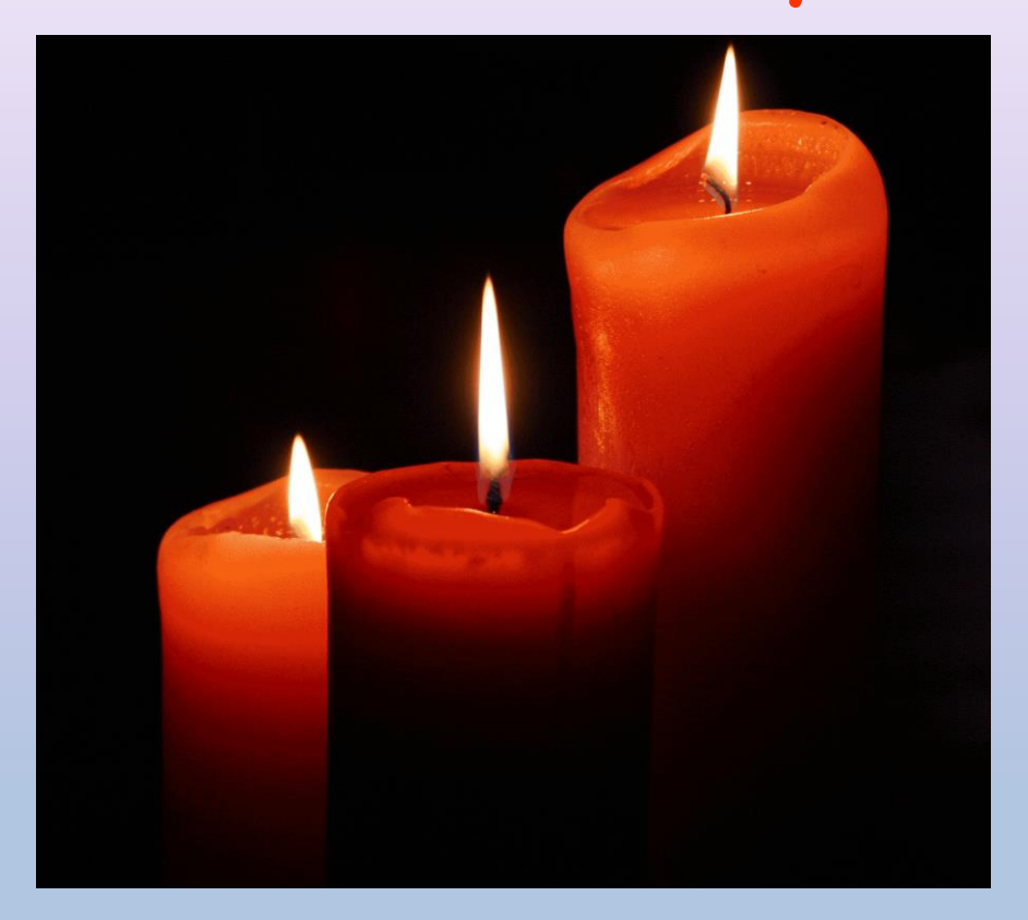
And also with you