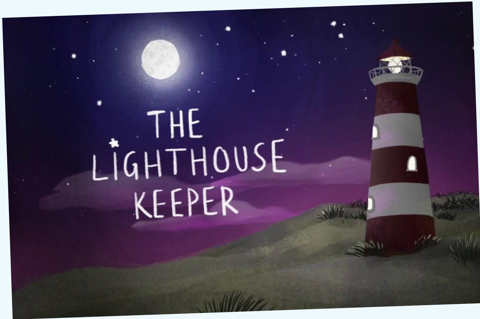
Lighthouse (Animation) - YouTube