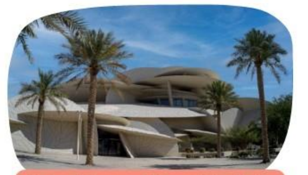
National Museum of Qatar, which tells the story of the country, from the pre-historic to the modern era.